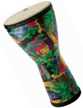
Remo drum (before the accident)

It still just about functions well enough for drum workshops, and is now a welcome addition to Steve's junk percussion collection with its own fascinating but cautionary history. (The rest of the damage was relatively minor, luckily, and the flute survived completely.) Remo claim that all their instruments are road tested for durability. This road testing obviously does not include being run over by a Volvo estate.