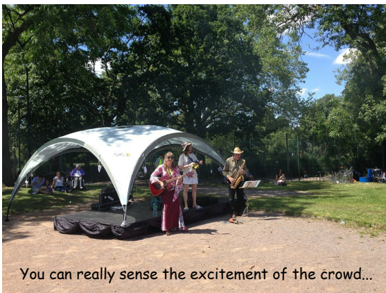
You can really sense the excitement of the crowd...