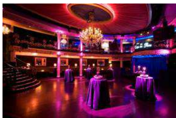
Cafe de Paris