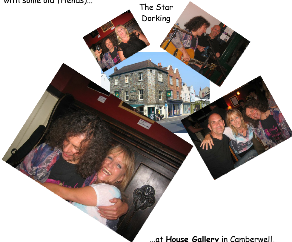
The Star Dorking