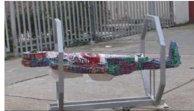
MRI (Magnetic Resonance Imaging) sculpture