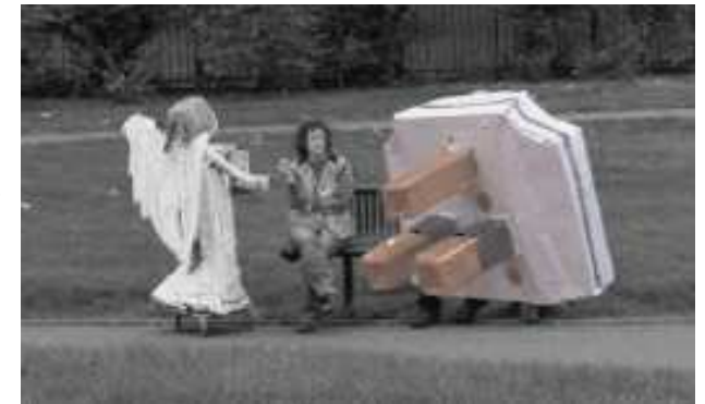
Octavia Hill (left) and Michael Faraday (right) sculptures