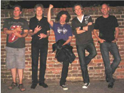
Outside Nutley Hall following the gig