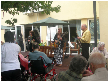
Ashton Lodge Nursing Home - Surrey

They were kept particularly busy at summer barbeques.