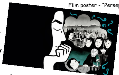
Film poster - "Persepolis"

One of these was a pre-screening set of popular covers, at Animated Worlds as part of Peckham & Nunhead Free Film Festival .